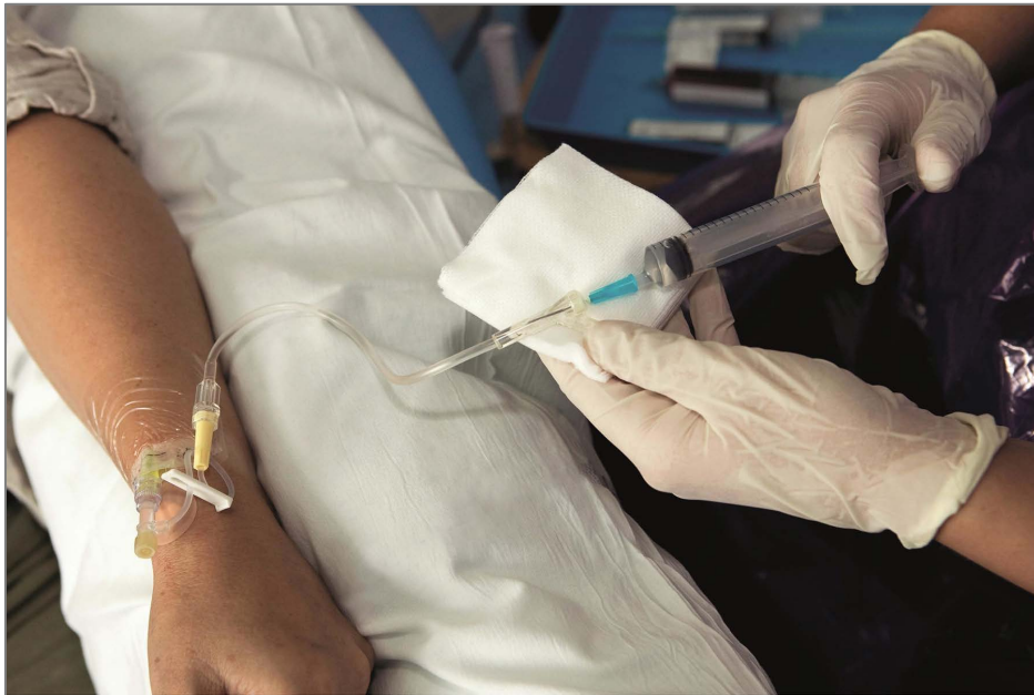
The first analysis of deaths through chemotherapy has found some hospitals are worse than others