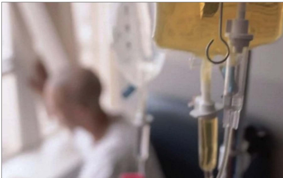
More than 1,300 breast and lung cancer patients died because of chemotherapy in 2014, the study shows

Chemotherapy is toxic for the body because it does not discriminate between healthy and cancerous cells.