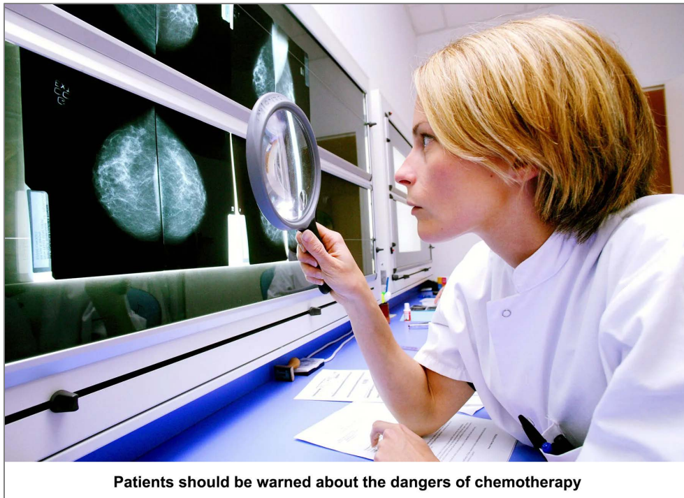
Patients should be warned about the dangers of chemotherapy

At Lancashire Teaching Hospitals the 30 day mortality rate was 28 per cent for palliative chemotherapy for lung cancer, which is given when a cure is not expected and treatment given to alleviate symptoms.