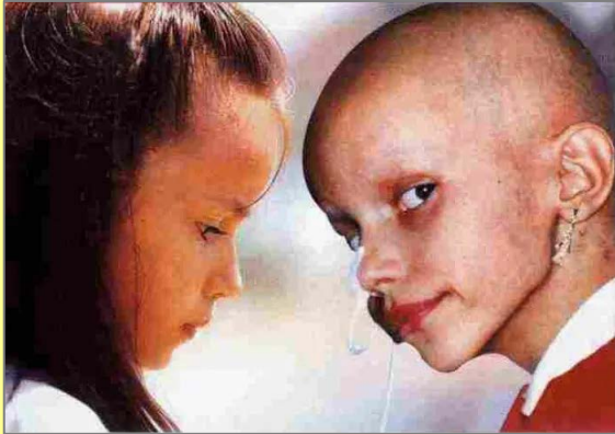
BEFORE AND DURING CHEMO-TREATMENT

"To sell chemotherapy as a 'therapy' is most likely the biggest deceit in the history of medicine. Whoever masterminded this chemo-torture deserves a monument in hell."