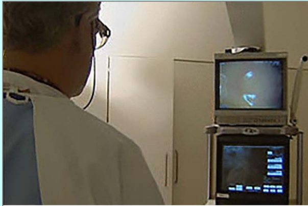
Doctors say many patients start chemotherapy without being fully informed about the procedure.